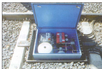
Fig. 3: The filling equipment for the noise reducing medium at the "Kaufungen, Gesamtschule" stop is installed at ground level between the rails.

frequency over the rails. In addition they noted the behaviour of the distribution system and its effects. They evaluated their results from the point of view of "as much as possible". While at the Heinrich-Plett-Straße a time-dependent control proved to be practicable, in Kaufungen (Fig.3) a control based upon tram frequency is better. The operation of the test equipment, which has been running under test since 22 nd May 2002, has been consistently environmentally friendly. The pumps operate with a saving on resources, obtaining energy from a photovoltaic unit, mounted in a fixed position above the overhead line. In order that when it rains the falling water can replace biogenous grease, a rain sensor works directly alongside the solar cells (Fig. 4). Data, for example about the level in the lubricant container, the rain sensor or pump malfunctions are sent from the control system to the control centre.